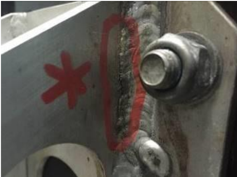
Cracking on a vertical weld – found by DPI