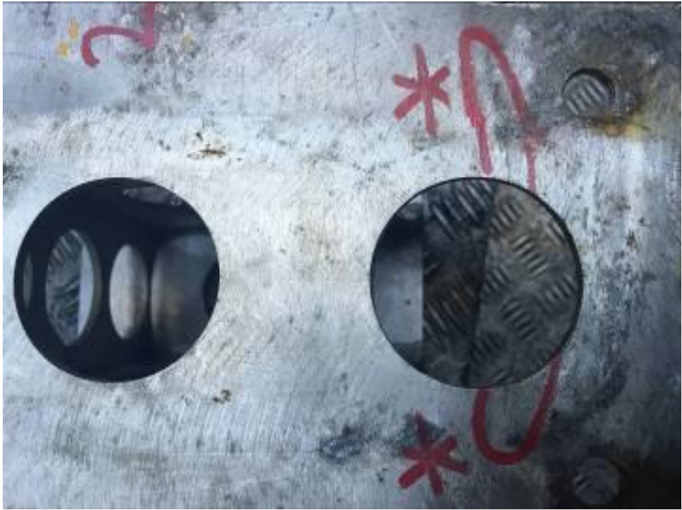
Cracking on the rear of the bracket found visually