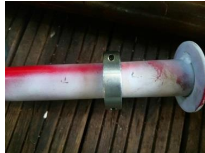
Figure 5 New clamp design