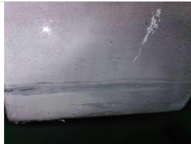
Figure 3 Cracking still present after grinding to a depth of 1.5mm