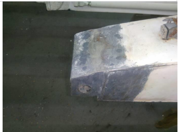
Figure 4 Area of paint removal